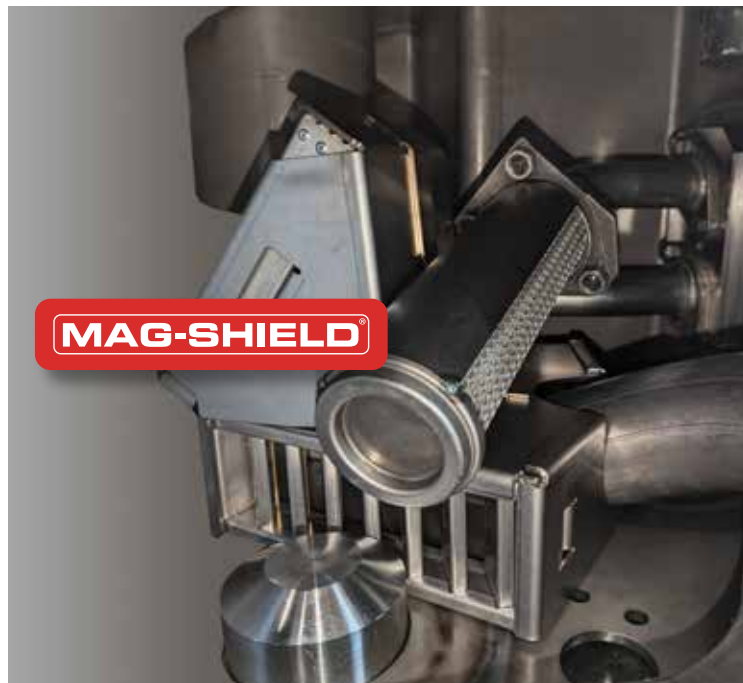
CAT D6T Mag-Shield® installation.

MagShield® is pleased to announce the availability of our range topping in-tank magnetic pre-filtration kit for the CAT D6T Dozer. Easy to install and maintain, Mag-Shield® is a no compromise solution that offers industry leading protection against ferrous contamination.